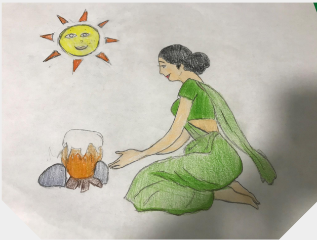
Drawn by Senuri Abeysirigunawardena