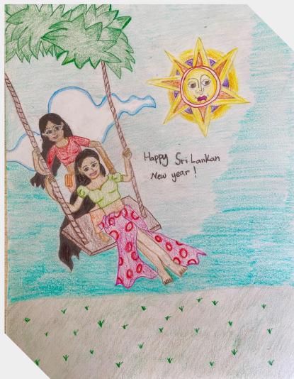
Drawn by Saheli Wickramaratne