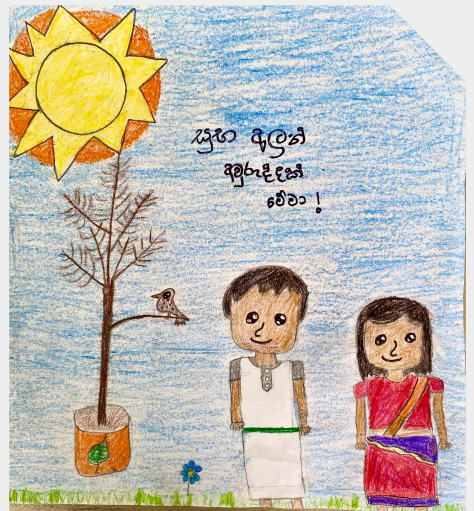
"Happy New Year" Drawn by Sithumi Wickramaratne