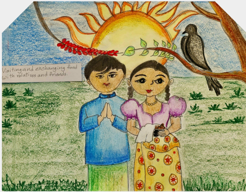
Drawn by Chenuli Rupasinghe